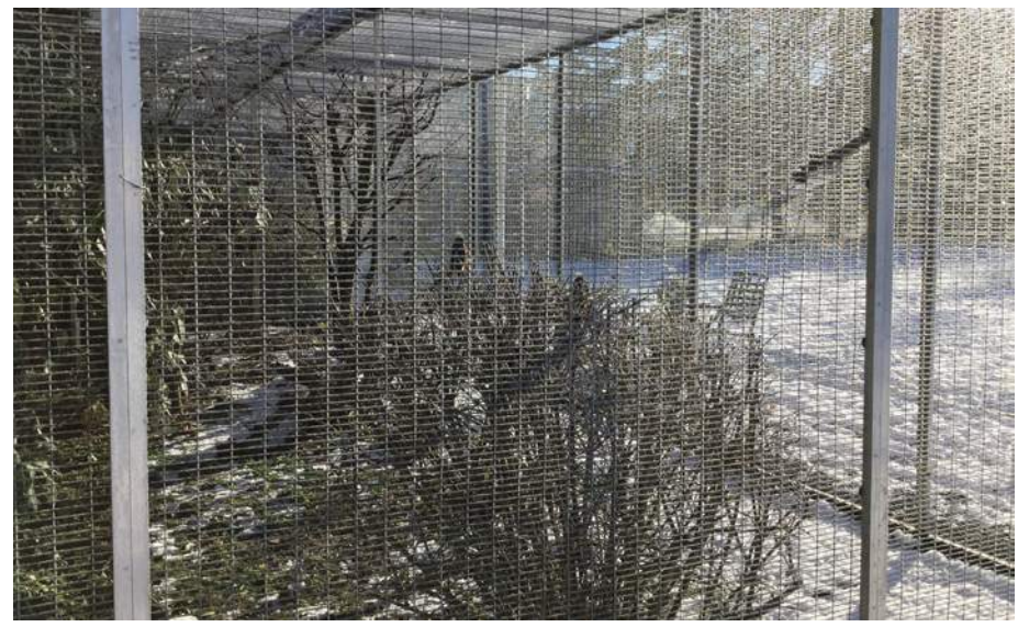
White Back Mousebirds sunning themselves on a cold, 20*F morning