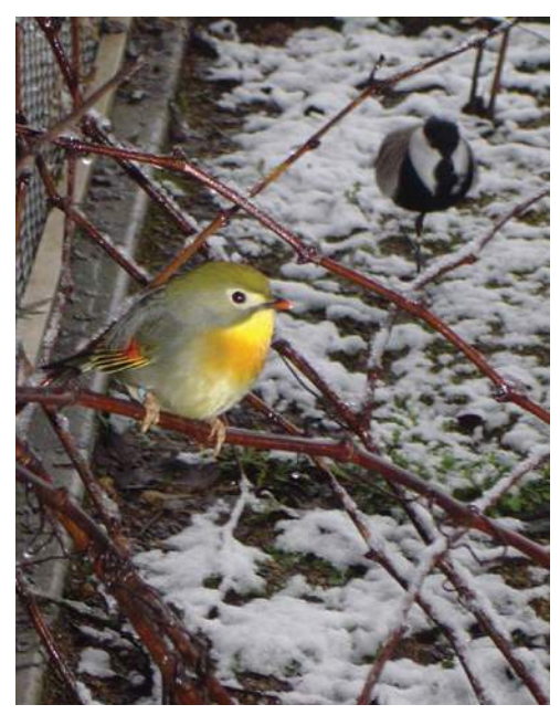
Snow in flights can make problems. Here a Pekin Robin and a Spurwing Plover deal with a light dusting.

When keeping birds year-round in outside aviaries, weather generally leads to lots of worry, especially in the winter. As a long-time breeder of various types of softbills housed in outdoor aviaries all year long, I am often asked for the minimum temperature that a certain softbill species can take. Most aviculturists would love it if someone could answer this question definitively, because it would make wintering birds outside much less stressful, both for us and our beloved avians.