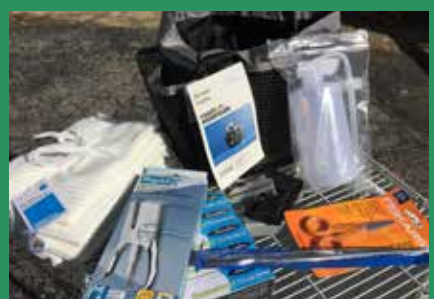
Some show essentials including dish clothes for cleaning cages and handling birds, a squirt bottle, scissors, long forceps, multi-tool, stapler and extra staples.

The majority of these items fit in my show bag, which is a large zip-top multi-pocketed affair from Thirty-One, approximately 20" L x 14" H x 8" W. Depending how many essentials you need to carry you might also consider a tool box to keep your smaller items or emergency medical supplies organized, most of my medical supplies fit in a gallon zip lock bag, which is easy to see and grab in an emergency.