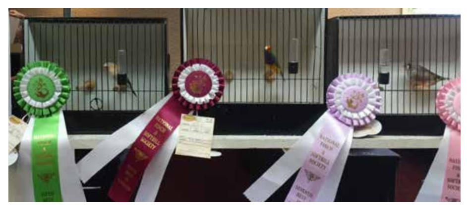
Top bench, fifth through seventh place; seventh place normal gray zebra hen exhibited by Jose Urrutia was best unflighted bird, bred in 2016.