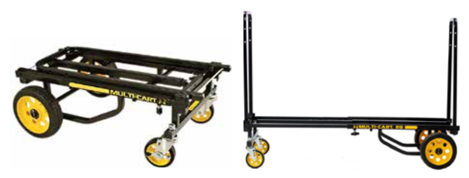
A cart like this Rock N Roller R8 Multicart is useful for moving your show bag, birds, and show boxes to the show hall.

By the time you have all of your essentials in your show bag along with birds and show boxes you either need a lot of energy, helpful friends, or a cart to haul everything around in. I have tried many types of carts over the past several years and after trial and error have concluded the Rock N Roller R8 Multicart meets my needs the best, it is available for around $150 from online stores including Amazon. It can carry quite a few show boxes and my show bag at once, yet folds up small so it doesn't take up much room in my car.