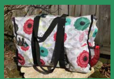
Show bag packed and ready to go!