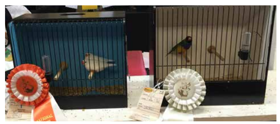
Top bench ninth place was the best pair, white zebra finches; tenth best in show was a normal red-headed Lady Gouldian finch cock.