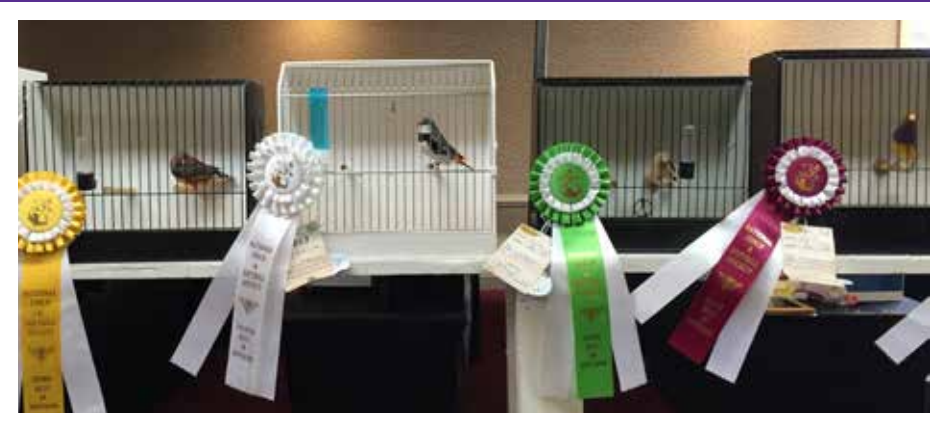
Top bench, third through sixth place.