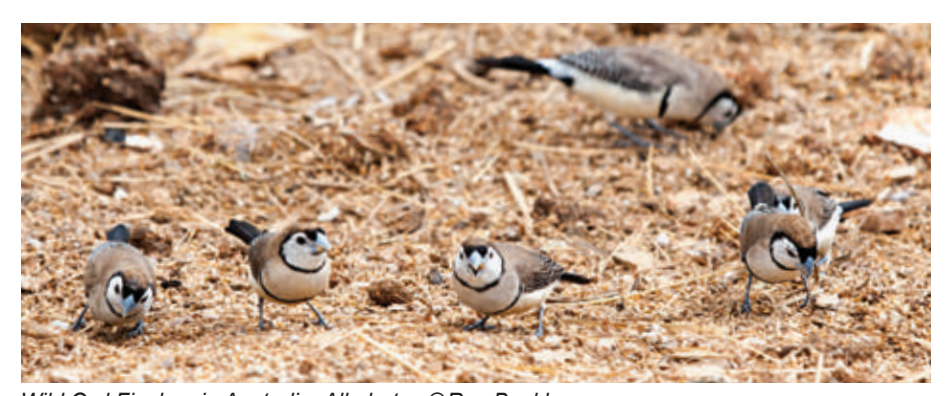
Wild Owl Finches in Australia.