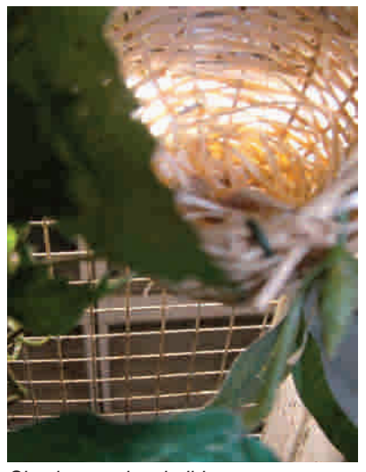
Simple nest they build

Breeding: An aviary to themselves will attain the best breeding results. They will utilize a square finch nest box or wicker basket, but the best I have found is half a coconut screwed into the side of the aviary with a small artificial branch next to it. They will build a small cup shaped nest made entirely of coconut fiber. The usual clutch consists of 2 eggs and these will hatch after approximately 10-14 days. Most of mine have been 10-12 days with the odd exception of 14 days. For the first 24 hours the chick absorbs the egg sac, but after this period, they will feed small fruit flies and the odd hatching pinky maggot flies. From day four up until day 10, they feed the chicks on hatching flies and the odd spider I can find. After day 10, they dip the flies into the nectar and then feed them to the chicks, continuing until the chick eventually weans to a complete nectar diet.