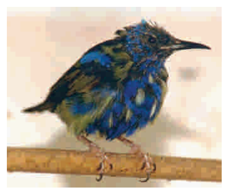
Young male I bred just coming into colour.

When they are first acquired, they must be kept on separated in quarantine and not in an aviary with others for approximately 2 weeks. This will allow any diseases that they may be harboring to become apparent without subjecting other birds to the infection.