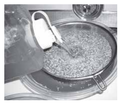
Pour enough soaking solution over the seed to completely cover it. Mix frequently.