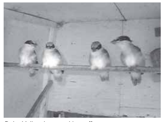
Baby Yellow breasted just off nest

an upside down 'L' shaped platform in such a way that eggs and young can be checked on a regular basis without any difficulty of taking down and putting back up We place the basket up in a corner of the shelter section We have had hens that nest from 4ft off the ground to 7ft (top of shelter)