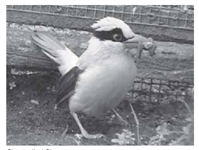
Short tailed Cissa

Fruit Dove breeder and expert, informed me of seeing recently caught birds that were entirely blue at bird markets in Singapore They do seem to spend most of their time in the aviary shelter or in the shade of the plants in the aviary