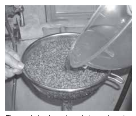
Time to drain - I use the solution to rinse the bowl and pour any loose seeds back into the strainers.

The thing I do that is VERY different from Mike's method is that I soak the seed on top of the clothes dryer while it is running The combination of HOT water and HOT dryer help to soften the hulls of the seed and chit it faster Because most seed we purchase from seed suppliers is NOT "Grower's Seed" like the Birds R Us seed, it takes a bit of heat to get the hulls to crack Using the hot water gives it a boost Soaking while on top of the dryer, the water stays hot longer and softens the hulls guicker My dryer takes approximately 30 minutes per load, so if I run 3 loads (and even with only 2 kids left at home, I can easily do 3 loads per day!), I know I've soaked the seed for a minimum of 1.5 hours