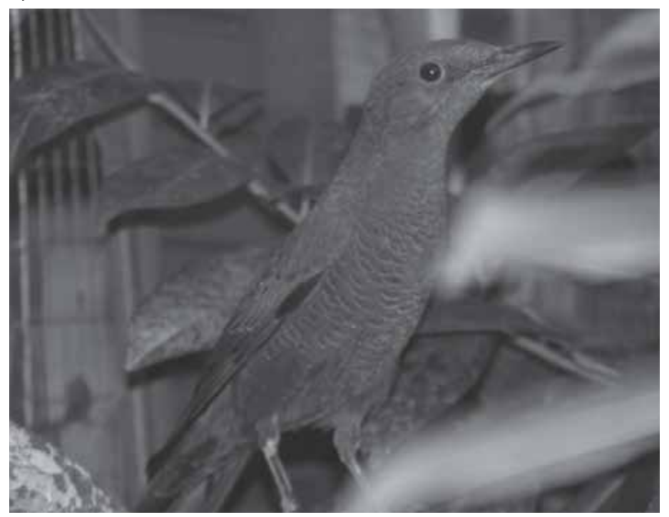
Early in 2009 I was offered a pair of blue rock thrushes from holland I had always liked them since looking after a pair a few years before for Ron Owen who now sadly doesn't keep birds

The pair duly arrived in February, I placed them in one of my back flights, which are 21ft long and 4 ft wide I found the birds like the added security of the length and can have a good fly to help condition.