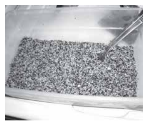
Combined seed - well mixed.

WARNING: And finally let me add. This is a SAFER way not a FOOLPROOF way to sprout seed You should still not take liberties or take silly risks. There are a tremendous number of variables which could not be considered in our trials. How dirty is YOUR seed, what is YOUR local climate compared with mine, how clean are YOUR feed pots compared to ours etc, etc.