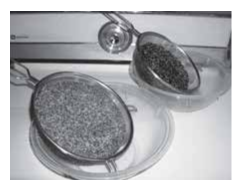
After draining, I tip the strainers up at a 45 degree angle to allow for best drainage, then allow to drain over night.