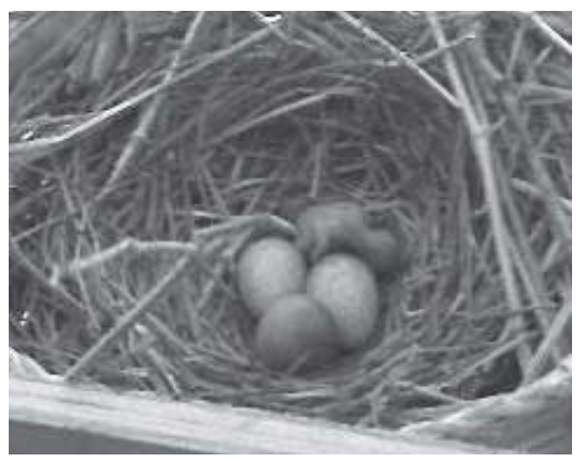
Day 1 and eggs of yellow breasted cissas

We have bred Long-tailed Cissas every year since 1997 and Yellow-breasted Cissas since 1999