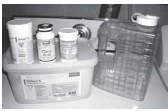
Use ONE - do NOT combine any of these together!

I mix the soaking solution with HOT water (not boiling, just hot out of the tap) I use 4 TEASPOONS PER GALLON of whichever product I am using at the time I've tested the effectiveness using Mike Fidler's recommendations (below) and