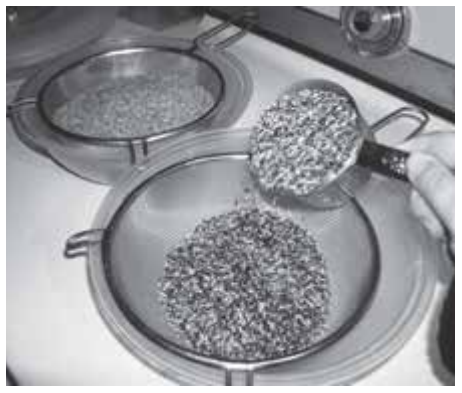
Strainers and Bowls - measuring seed 1:2