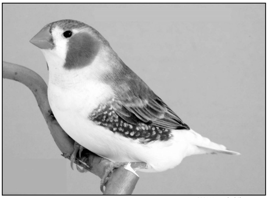
2006 Veenendaal Show winner.