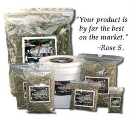
"My birds love it!" ~William W.

"We consider Herb Salad essential to our feeding program." Twin Beaks Aviary began using Herb Salad in 1989. Increased breeding success, minimized use of meds and lower incidences of illness is a testament to its effectiveness. "We promise freshness and quality in all of our products and back it with a 100% Satisfaction Guarantee."