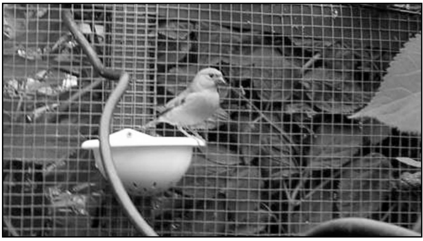
The Hen on one of the nestpans (not the one she eventually chose).

During the summer the hen laid several clutches of eggs. Although the pair were regularly seen mating each clutch turned out to be clear. The hen sat very tightly, eventually realising that they