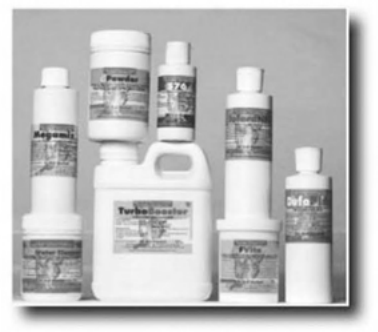
The Original & Best